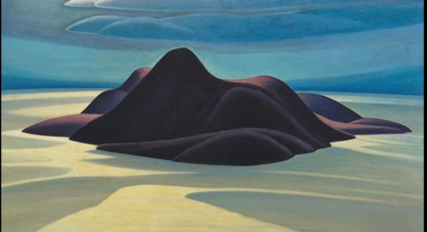
Pic Island by Lawren Harris